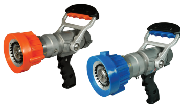
Fire Pokador nozzles