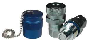
Hydraulic Fittings VEP series

Visit dixonvalve.com to order your copy of the 2013 Dixon Price List. Dixon: The Right Connection for quality, service and innovation.