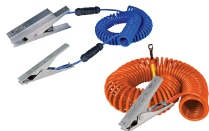
Rack Equipment static bonding and grounding clamps