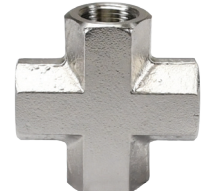
316 stainless steel