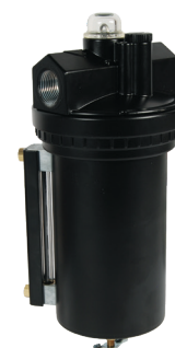
with metal bowl

NOTE: SCFM ratings at 120 PSIG inlet pressure.