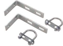
mounting bracket 6212-50