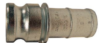
plated malleable iron