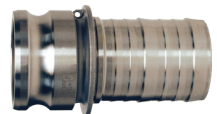
316 stainless steel