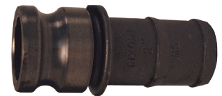
unplated malleable iron