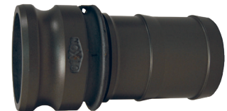
aluminum hard coat