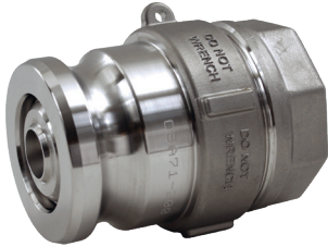
Adapter x 1-1/2" and 2" Female NPT