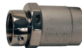
polished chrome plated